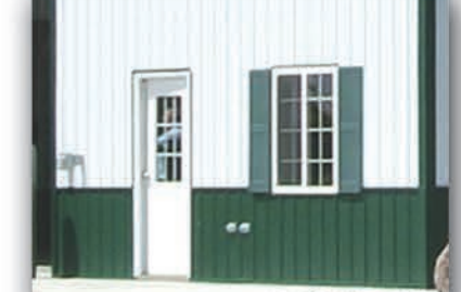
Maintenance free insulated doors and windows are available in a wide variety of styles.