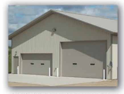
Durable overhead doors are matched with a tough and powerful lift system.